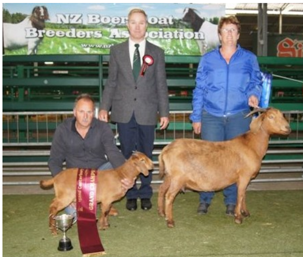
2014 NZ Red Boer Grand Champion Doe