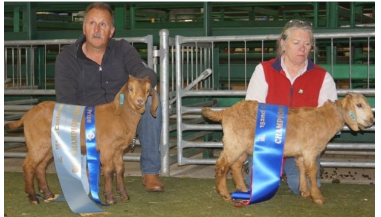
2014 NZ Red Boer Junior Champion Buck & Res