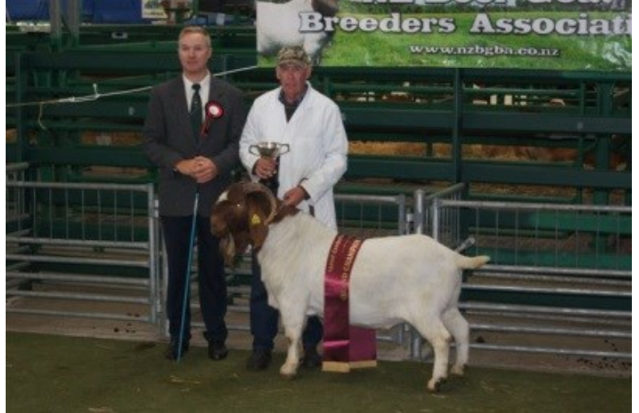
2014 NZBGBA Grand Champion Buck