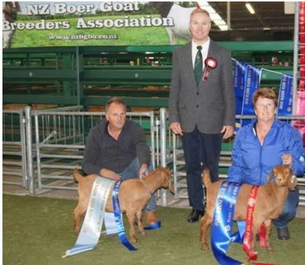
2014 NZ Red Boer Junior Champion Doe & Res