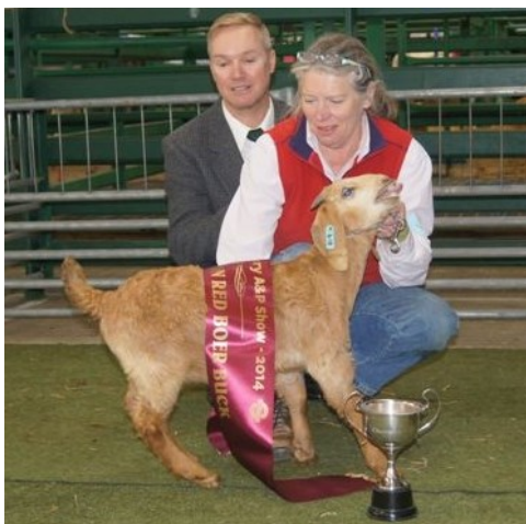
Two Aussie's showing us how - yeah right!