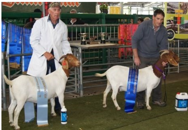
2014 NZBGBA Senior Champion Doe (RH) & Reserve