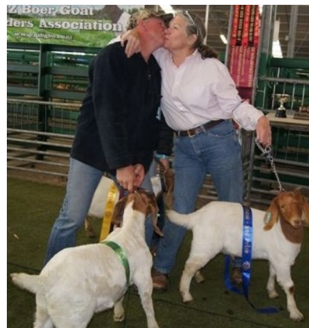
Trans-Tasman relationships thriving