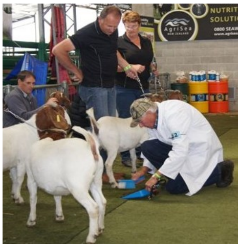
Executive working together