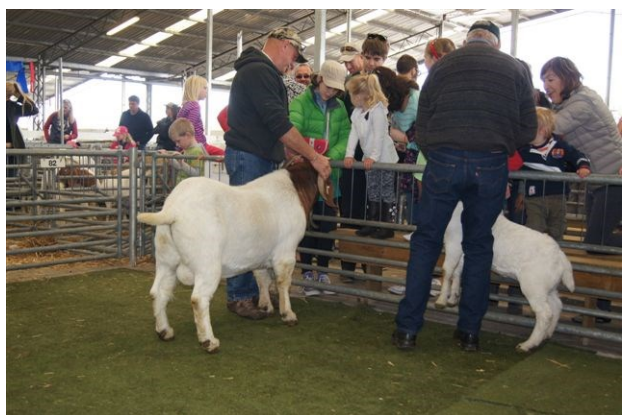
Public hands on time