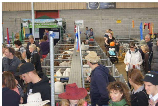
Plenty of interest