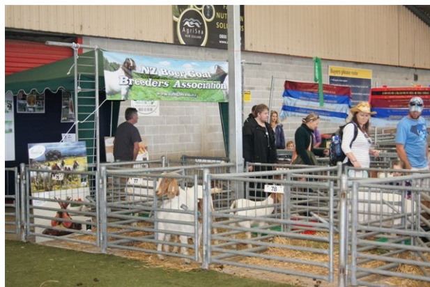
NZBGBA contact point