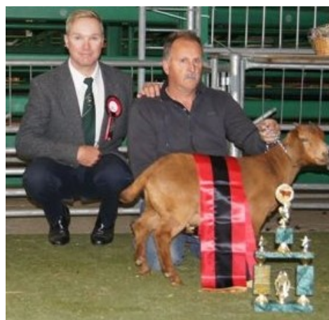
2014 NZ Red Boer Supreme Exhibit