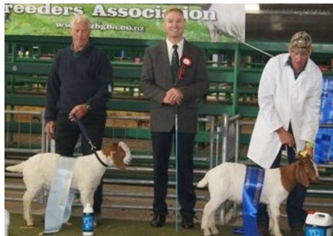
2014 NZBGBA Junior Champion Buck (RH) & Res