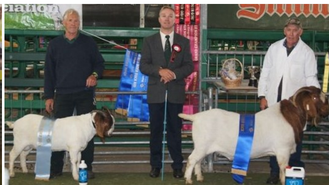
2014 NZBGBA Senior Champion Buck (RH) & Reserve