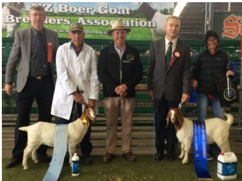
2014 NZBGBA Junior Champion Doe (RH) & Res