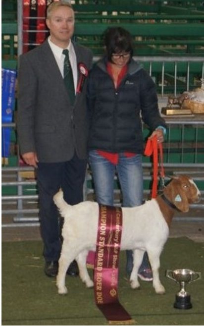
2014 NZBGBA Grand Champion Doe