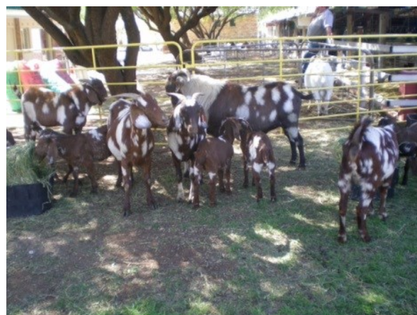
Ancestors of the Boer goat - 2008 SA National Show

Then he bought a buck from the Cradock area. It was a large red dappled buck with a strong constitution. This buck and ewes were therefore the foundation of the current flock. About 60 years ago all farmers kept a few Boer goats. In those days however, they were almost all colours of the rainbow, many long haired and a mix of ear shapes. The only trait that farmers considered in those days was constitution. The colour, proportion, uniformity and pigmentation did not matter in the least. In 1925 my father bought another buck and a few years later another from the same farmer in Bedford. It is remarkable how often the red dappled goats were used by breeders in the Eastern Cape. Today many breeders deny that the bucks were multi coloured. Van Rensburg (1938) divides the goats in South